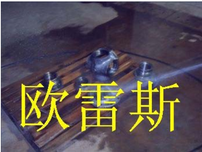
Import valve repair photos