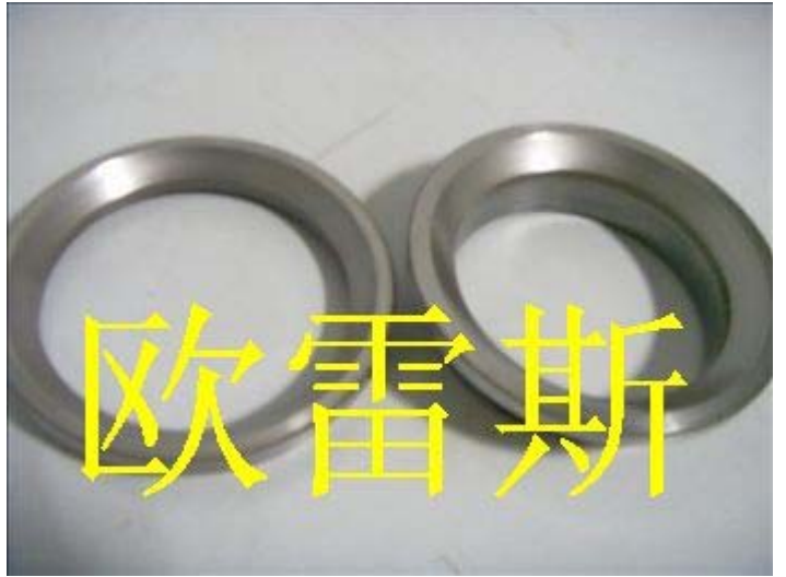
High-pressure valve repair groove