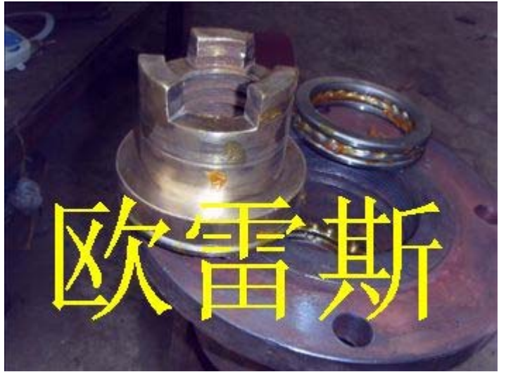
Welded butterfly valve repair