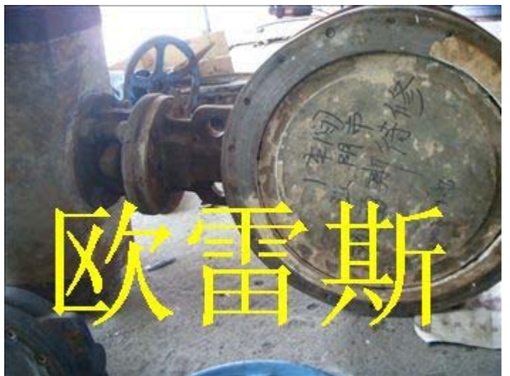
Seal valve seat repaired