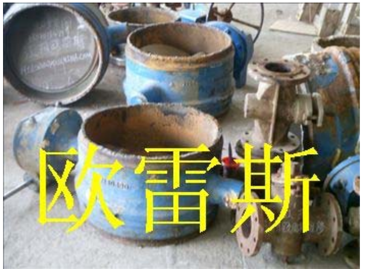
Pneumatic butterfly valve gate repair photos