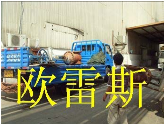
Valve repair before the photo