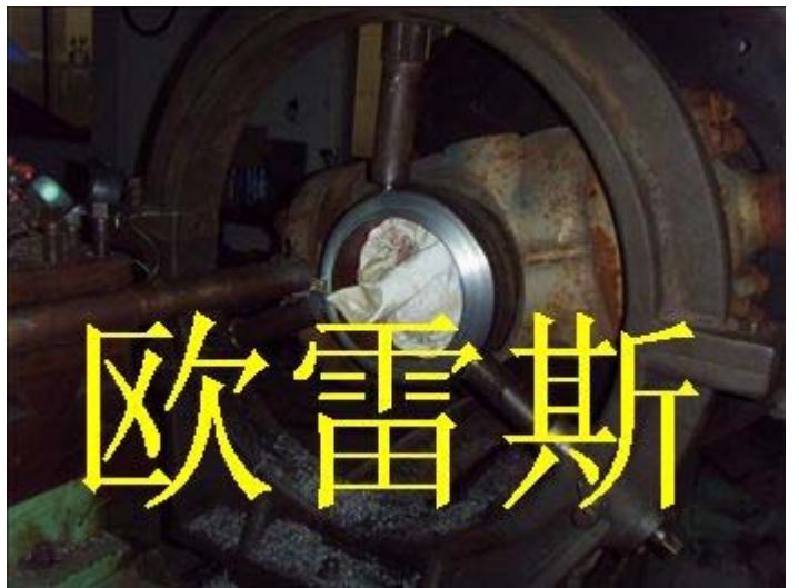
Hard seal ball valve repair for discharge