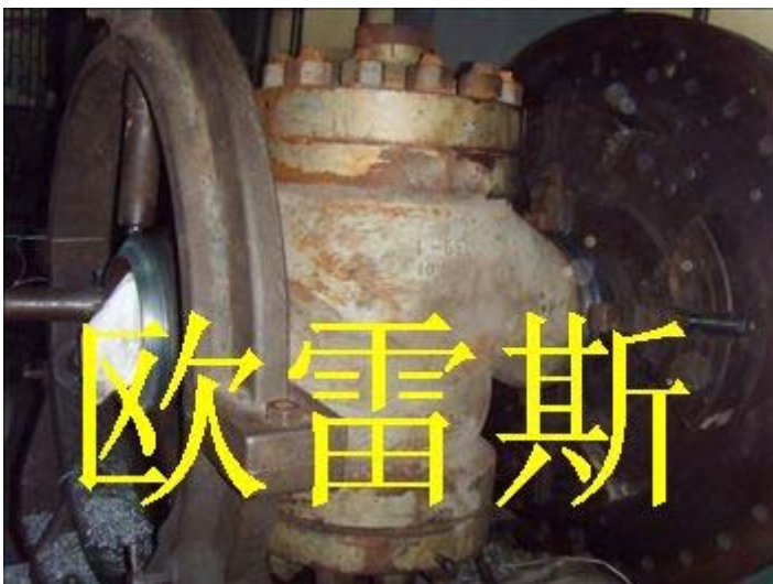
Maintaining of high-pressure valve demolition