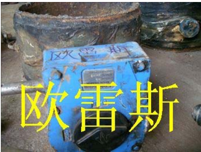
Hard seal ball valve repaired