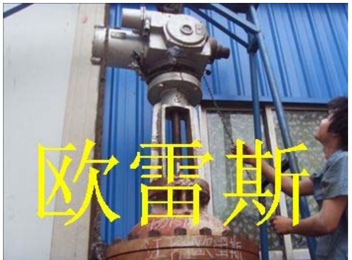
The implementation of the connector valve repair