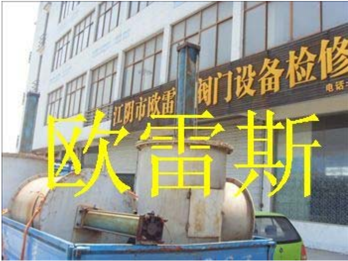
Valve repair and clean