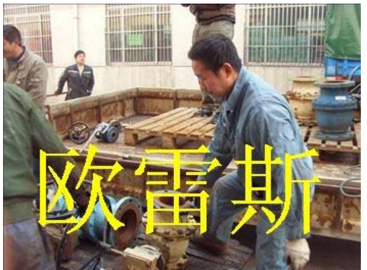
Slagging of Gate maintenance demolition