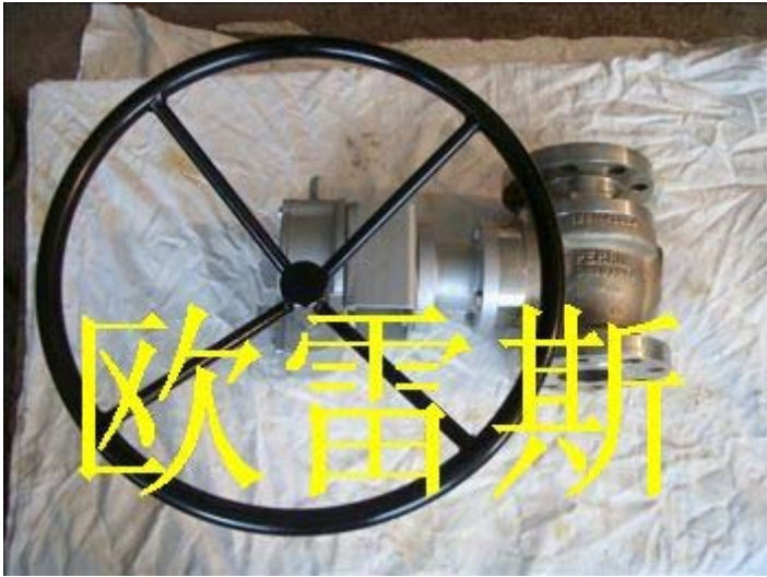
Seal hot core repaired